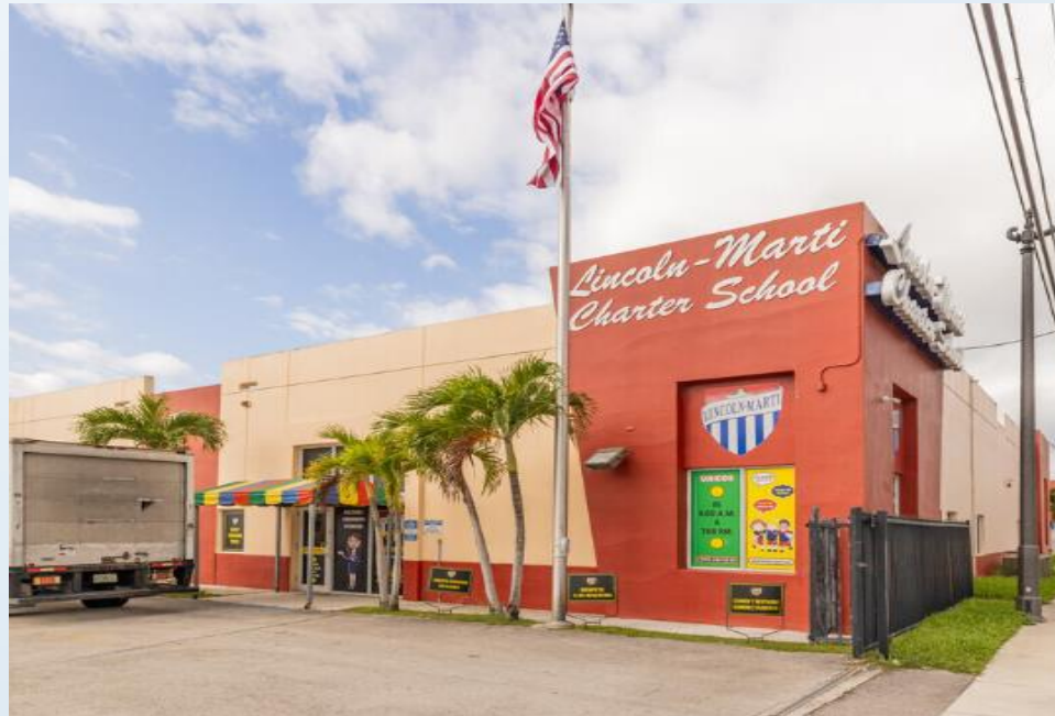
Lincoln-Marti Charter Int'l Campus is a Title I School.

Federal guidelines require Title I schools to hold an Annual Parent Meeting About the Benefits of the Title I Schoolwide Program to inform parents of Title I requirements and discuss their rights to be involved in the Title I Schoolwide Program.